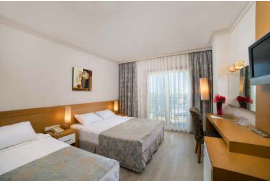
Annex Building Standard Room