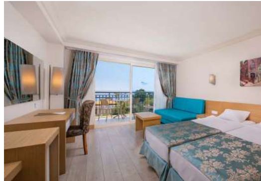
Main Building Standard Room