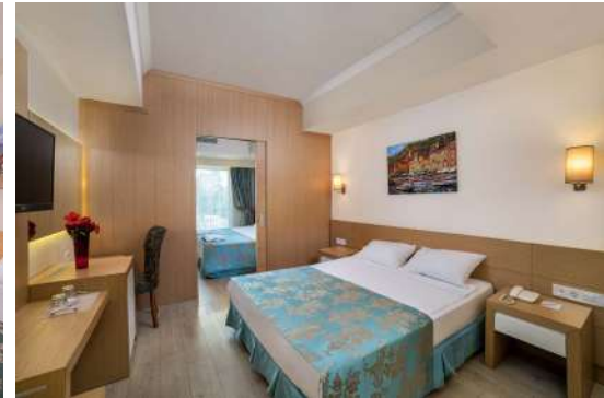
Main Building Family Room